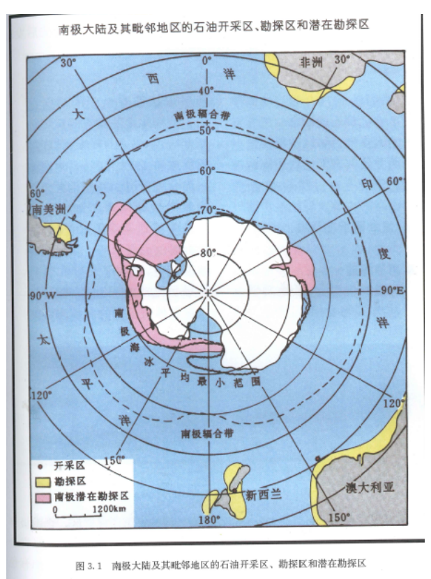
Chinese government map of Southern Ocean mineral exploration zones<sup>81</sup>

Polar Research Institute of China (PRIC) researchers estimate that there are 500 billion tons of oil on the Antarctic continent and 300 to 500 billion tons of natural gas on the Antarctic continent, plus a potential 135 billion tons of oil in the Southern Ocean.<sup>77</sup> In 2009, PRIC staff produced a book-length study investigating the full range of Antarctic mineral resources and their legal status, stating that "when all the world's resources have been depleted, Antarctica will be a global treasure house of resources."<sup>78</sup> China's annual polar report notes that access to the considerable natural resources in Antarctica (and the Arctic) is essential for the continued growth of the Chinese economy.<sup>79</sup> A 2013 report in the CAA's Polar Strategy Research Trends comments that "regardless of how the spoils are divided up, China must have a share of Antarctic mineral resources to ensure the survival and development of its one billion population."<sup>80</sup>