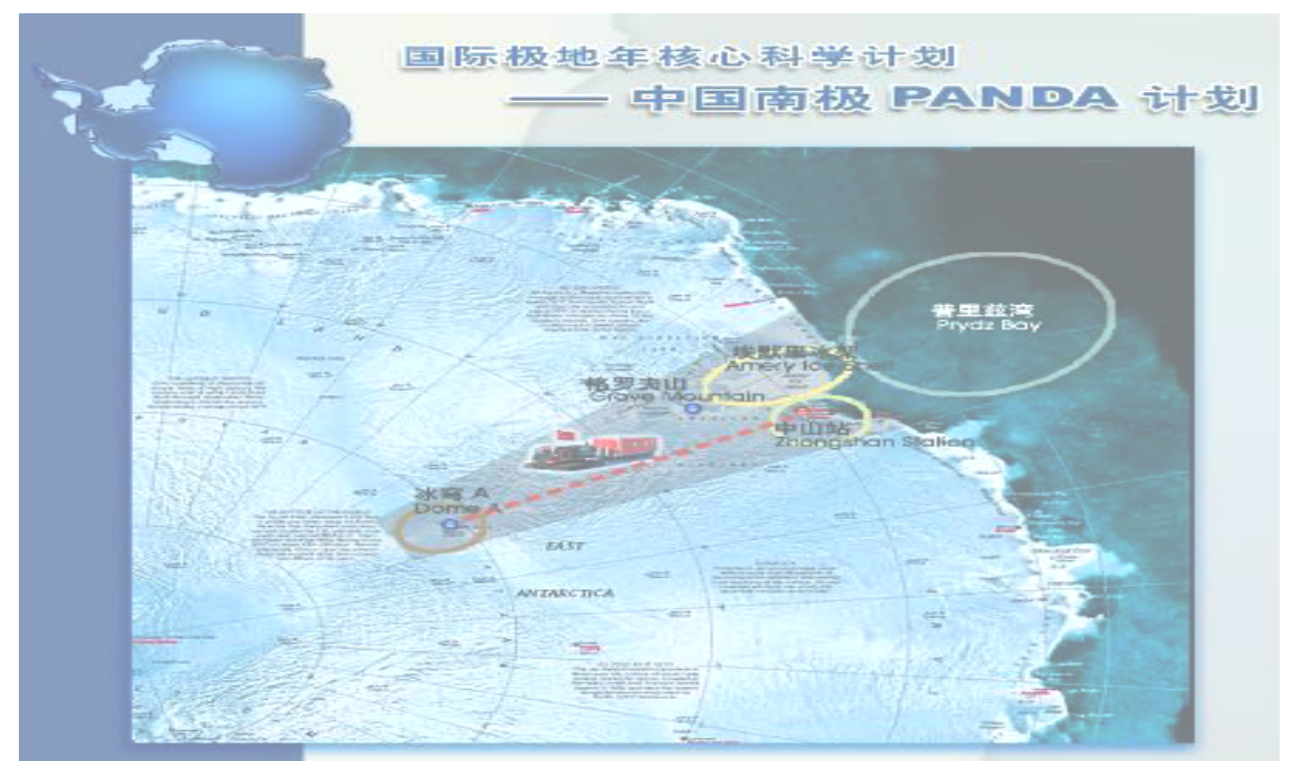
Map shows China's main area of activity in Antarctica, what it calls the East Antarctic Sector.<sup>38</sup>

In the last ten years, China has worked to extend its presence over a triangular area of East Antarctica. Three of China's Antarctic bases, three of its air fields, and its field camps in the Grove Mountains and Gamburtsev mountains are in this sector; which is within the existing Antarctic territorial claim of Australia. Through its advanced logistics capabilities, China is able to project its power and continually maintain its presence in this area of Antarctica, something Australia, with its much more limited Antarctic capacity cannot do.